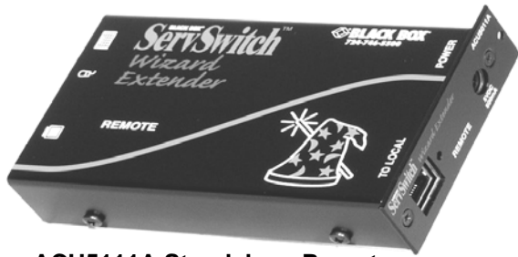
ACU5111A Standalone Remote Unit