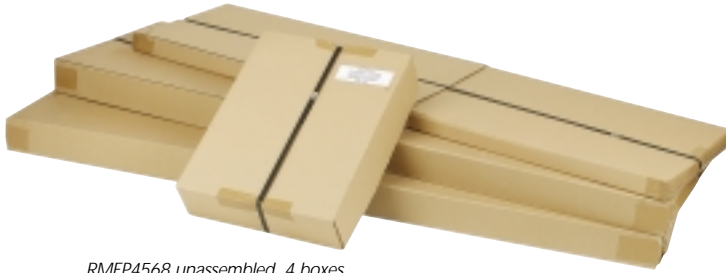
RMEP4568 unassembled, 4 boxes