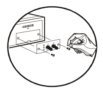
Figure 2: Removal of cover plate