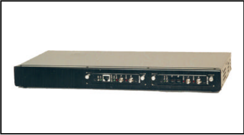
Figure 1: CityLIGHT 1U Chassis