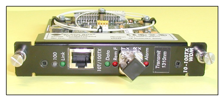
Figure 1 - CityLIGHT 10/100 Ethernet WDM Transceiver Card

The CityLIGHT 10/100 Ethernet WDM Transceiver Card reduces received jitter which ensures error-free operation when connected to any IEEE 802.3 device.